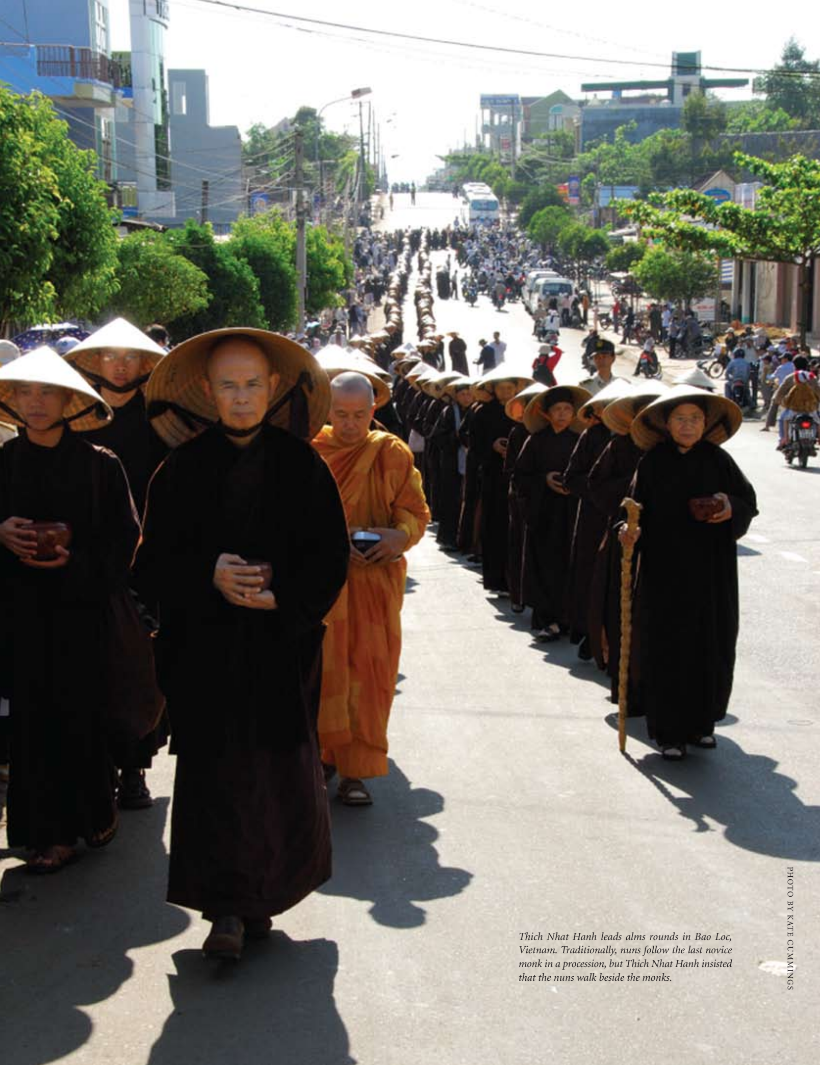
Thich Nhat Hanh leads alms rounds in Bao Loc, Vietnam. Traditionally, nuns follow the last novice monk in a procession, but Thich Nhat Hanh insisted that the nuns walk beside the monks.