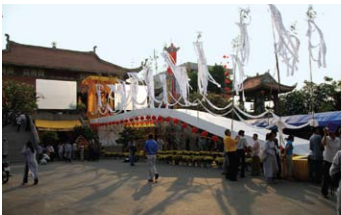
Left: A ceremonial bridge constructed at the Saigon temple for the Grand Requiem Mass, symbolizing a route for departed souls to pass from suffering. Right: Thich Nhat Hanh arrives at Tu Hieu, the temple where he became a novice monk.

After a silent, meditative breakfast with the other international sangha members in our hotel restaurant, we take a bus to the Phap Van temple, the base for Thay’s Engaged Buddhism back in the sixties. A swarm of cameras greets the stately arrival of Thich Nhat Hanh, who leads us on a slow, calming, walking meditation. Then we gather in the dining hall to receive our robes and alms bowl. I’ve always been drawn to the simplicity and focus I’ve witnessed in monastics, particularly in the joyous Plum Village sangha, and I’m thrilled with this opportunity to be a semi-monk for a month. I look around at my new traveling companions—seventy foreigners from around the world—all dressed up in light blue robes, tentative and slightly awed by this sudden transformation. We are no longer civilians.