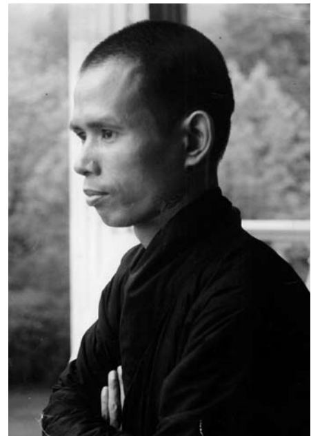
Thich Nhat Hanh, 1964

With a lived understanding of how all life interconnects—what he calls “interbeing”—Thich Nhat Hanh went beyond mere thought or contemplation and took action. In the midst of the Vietnam War, he founded the Order of Interbeing, started an important peace magazine, and launched Youth Social Services, a group of committed practitioners who saw the Buddha's teachings as a truth that required them to be “lotuses in a sea of fire.” He