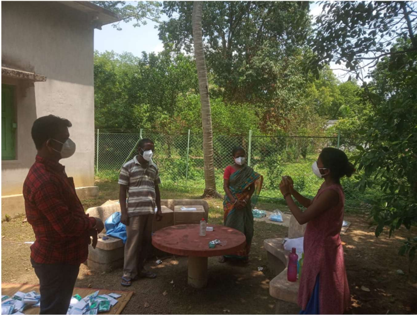
Team members learning how to use the Oximeter