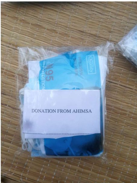
A kit with N95 mask, surgical mask, soap, towel and Covid care instructions in the local language, are being distributed to different households in Dehradun and Shantiniketan villages