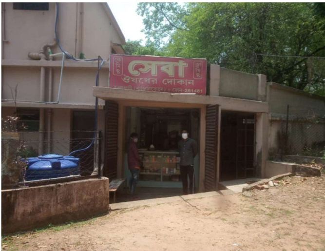
The medical store where patients are sent to collect medicines and reimbursed by Ahimsa