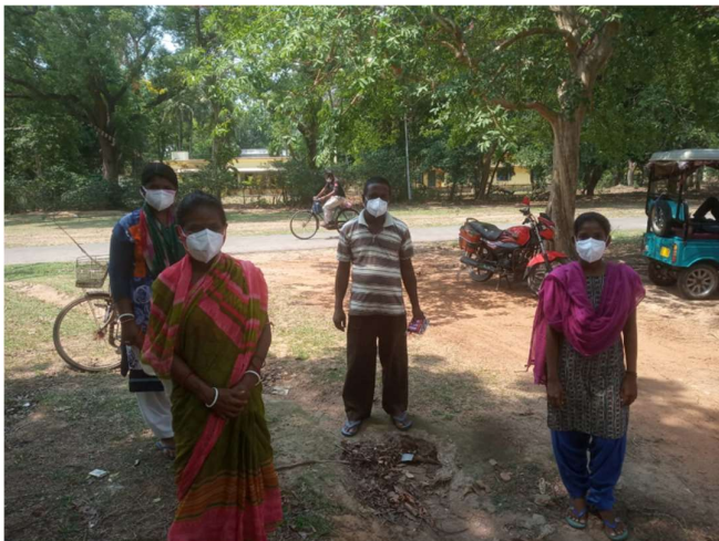
Our Shantiniketan team, masked and ready to go