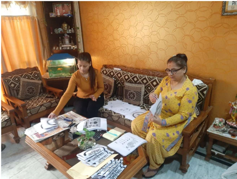
Our team member's family pitching in by making kits for households to be distributed in village Rajpur Mafi, Dehradun