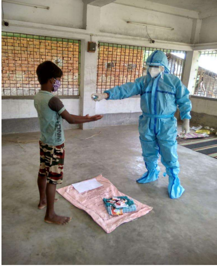
A team member distributing Covid Care Kit sent by Ahimsa