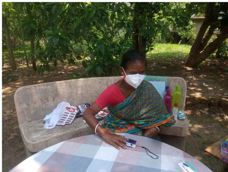
A team member testing her oxygen level

PS The lockdown in Bengal only allows movement and shops open from 7 am to 10 am. I'm afraid lockdown rules were broken today